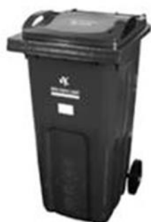
Grey wheeled bin collected weekly for residual waste