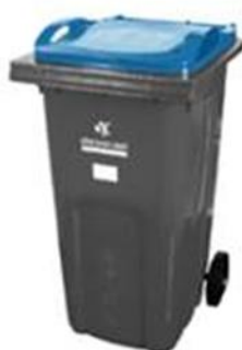
A wheeled bin with a blue lid plastic, metals and glass