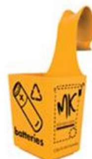
A battery container that hangs on the side of the bin

The last formal consultation on waste services took place in 2005. The procurement of a new service for 2023, provides an opportunity to understand what is important for the delivery of waste and recycling services to the residents of Milton Keynes.