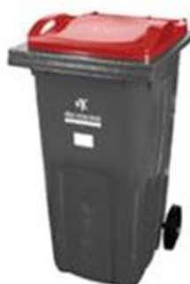
A wheeled bin with a red lid for paper and card